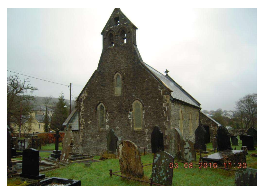
St Teilo's, Brechfa, Carmarthenshire.